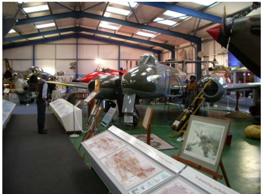
Fast jets from the cold war era