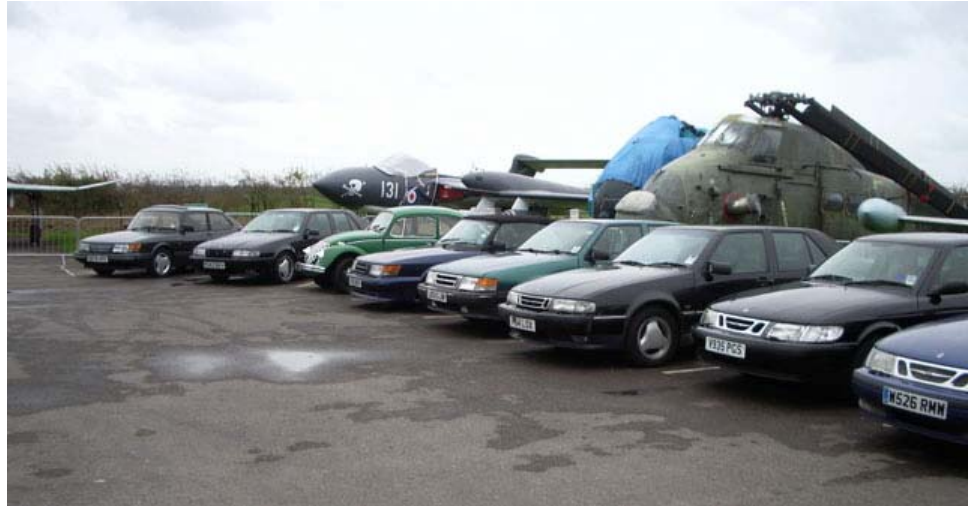
Saab (and Beetle) line up outside the museum

After a short sedate cruise, we arrived at the equally exposed and cold museum, where another group of Saabs (from the Hampshire direction) had just arrived.